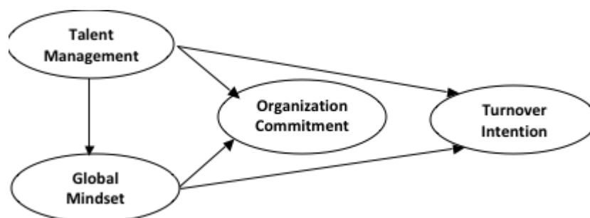
Figure1. Research Paradigm

Based on the problem identification above, the model and hypothesis that can be provided as follows: